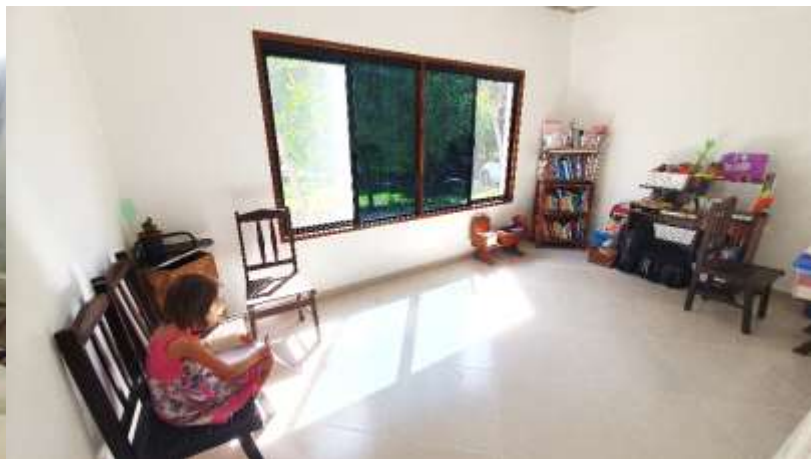
...and a new space for home-school

The office/home-school area is changing and now has a window, bookshelves and a desk. With the odd leak we are not able to set-up any permanent electrical equipment yet. But we are very happy to have unpacked some more of our items from the UK.