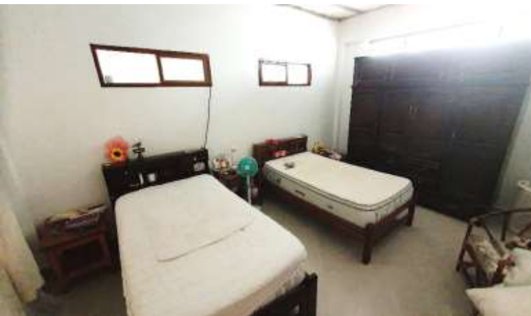
The girls are in their bedroom...