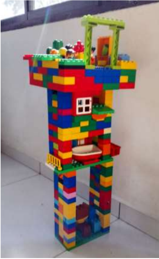
Our girls have been building...and making apple ducks!